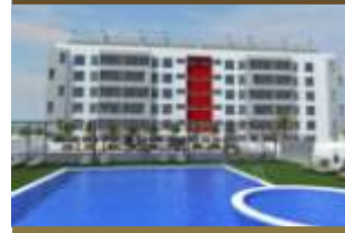
Murcia / Los Dolores Residencial Amelie

165 viviendas / 165 properties 5,253 m 2