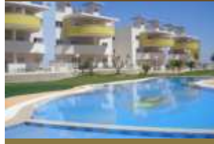
Alicante / Orihuela Costa Novogolf

124 viviendas / 124 properties 13,894 m 2