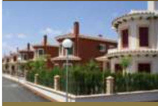
Mallorca Pinars de Murada

333 viviendas / 333 properties 120,000 m 2