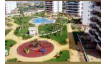
Alicante Arenales Playa

408 viviendas / 408 properties 107,000 m 2