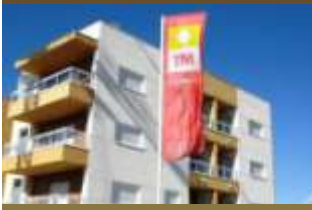
Murcia / Molina de Segura Los Álamos de Molina

180 viviendas / 180 properties 19,000 m 2