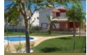
Alicante / Busot Costa Blanca

127 viviendas / 127 properties 28,389 m 2