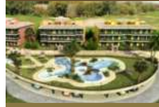
Mallorca Mar ses Cales

118 viviendas / 118 properties 19,000 m 2