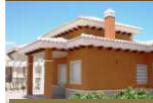
Alicante / Aspe Villas de Aspe