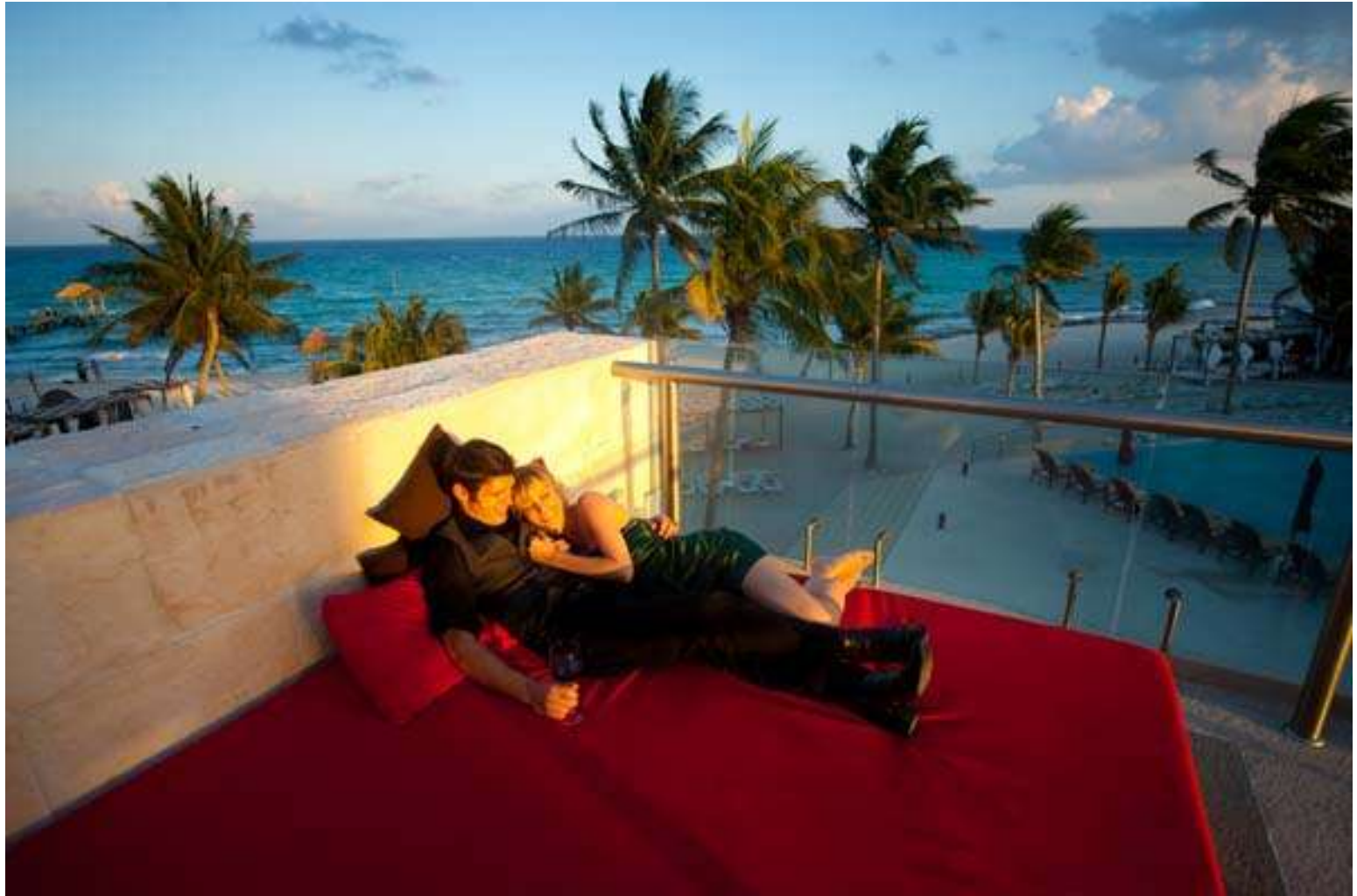
Zky Bar view