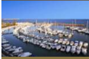
Alicante / Orihuela Costa Residencial Sol Marino

124 viviendas / 124 properties 13,894 m 2