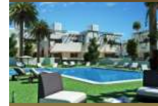
Pulpí / San de los Terreros Mar de Pulpí

165 viviendas / 165 properties 5,253 m 2