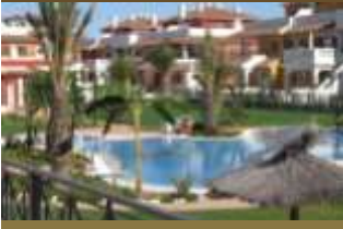
Alicante / Orihuela Costa Zeniamar

1255 viviendas / 1255 properties 250,000 m 2