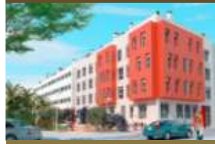
Murcia / Los Dolores Edificio Carole

294 viviendas / 294 properties 27,880 m 2