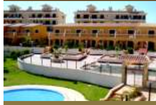
Mallorca Valls de Cala Domingos

118 viviendas / 118 properties 19,000 m 2